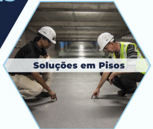
Soluções em Pisos