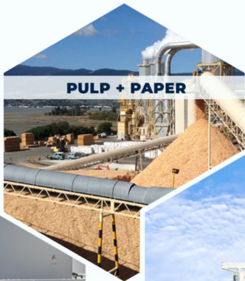
PULP + PAPER