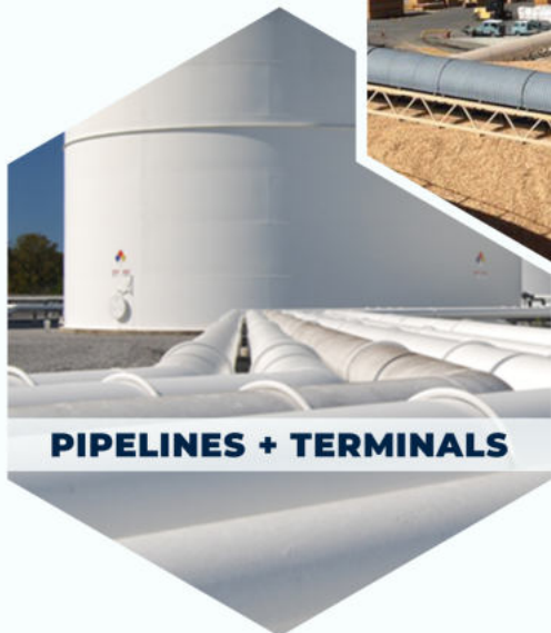
PIPELINES + TERMINALS