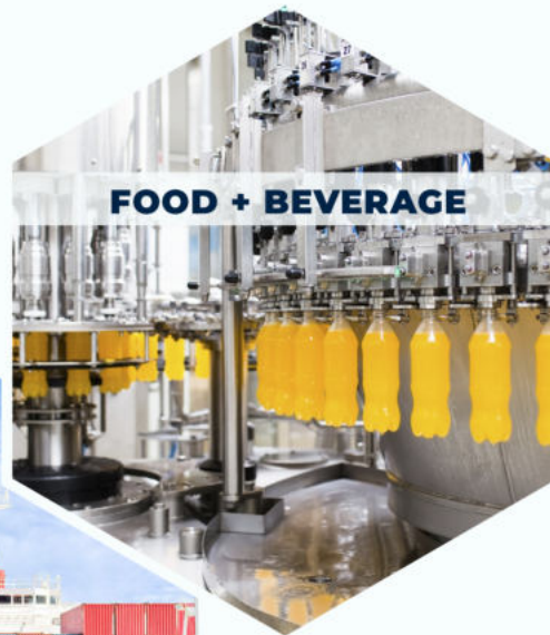
FOOD + BEVERAGE